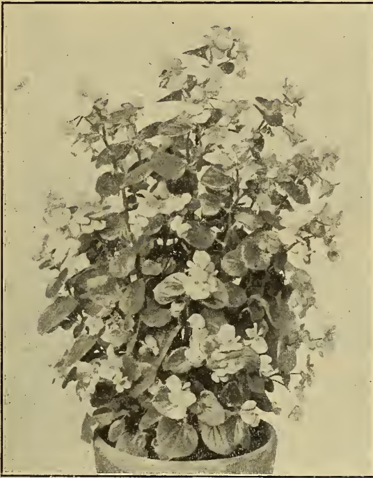
BEGONIA GLORIE DE CHATELINE

Glorie de Chateline. A very valuable variety that bids fair to become popular with the grower. It is an easy grower; free flowering; excellent both as a house plant and for bedding purposes. 2½-inch pot plants, $5.00 per 100, $45.00 per 1000.